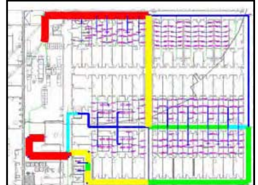
Total travel distance = 22,158ft/day – current state