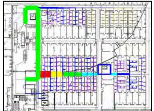
Total travel distance = 12,951 ft/day – optimized